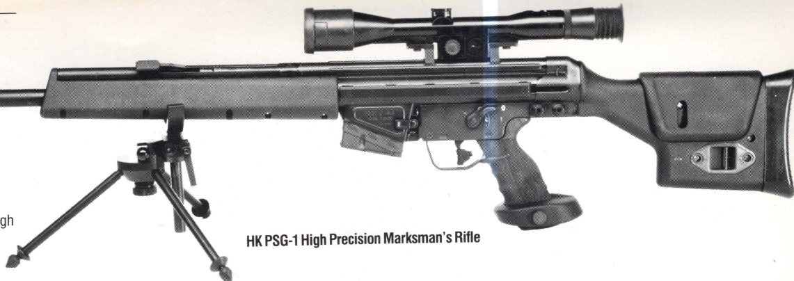
HK PSG-1 High Precision Marksman's Rifle