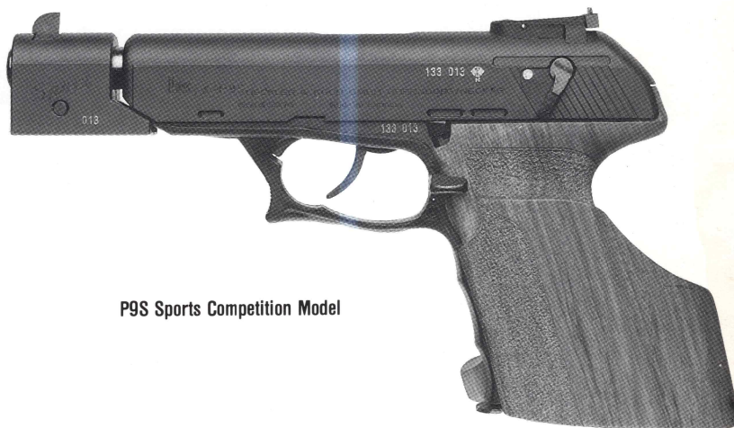
P9S Sports Competition Model