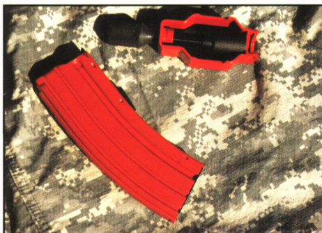
Heckler and Koch Safety Blank Firing Magazine and Safety Blank Firing Adapter for M4 weapons, 14.5 inch barrel.

A Blank Firing Adapter is required to function a gas operated weapon when firing blank ammunition. This device restricts the escape of gas from the muzzle ensuring sufficient pressure is generated to reliably actuate the bolt and cycle of operation.