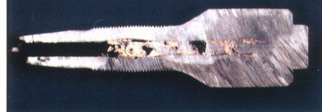
Cutaway of HK SBFA showing 3 trapped rounds