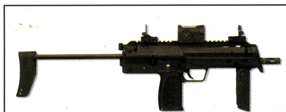
MP7 with buttstock and foregrip extended, mechanical sights raised

The HK MP7 and the 4.6x30mm family of high performance ammunition were developed to provide penetration and lethality approaching that of an assault rifle in a package small and portable enough to be carried like a handgun. Adopted and fielded by the German special operations unit "KSK" in 2002, the MP7 is now available to U.S. military and law enforcement organizations.