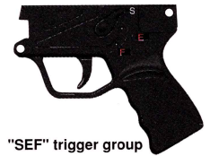
"SEF" trigger group