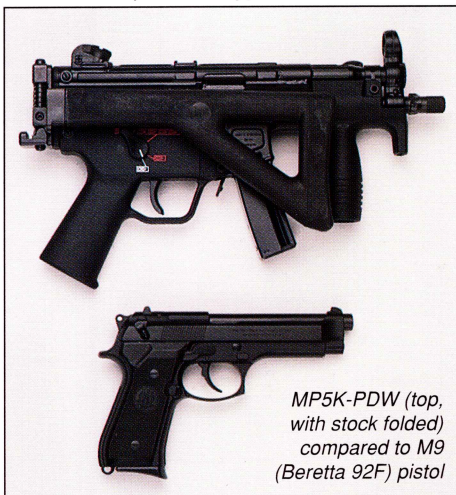
MP5K-PDW (top, with stock folded) compared to M9 (Beretta 92F) pistol

A high degree of interchangeability of parts and accessories with other models of the MP5 reduces the logistics burden and increases the operational flexibility of the MP5K-PDW. This feature, together with its closed-bolt operation, positive safety/selector switch, and roller-locked bolt, make the MP5K-PDW the safest, most effective weapon of its type available.