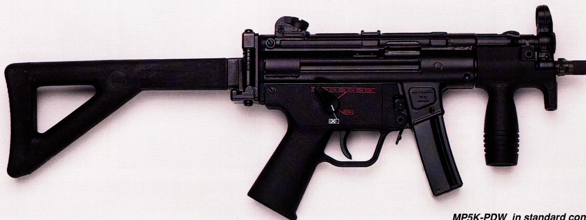
MP5K-PDW in standard configuration

The MP5K Personal Defense Weapon (PDW) was designed as a compact weapon for vehicle or aircraft crewmen. Whether supplementing the sidearm or replacing it, the MP5K-PDW provides an unmatched degree of personal firepower in a package small and light enough to be worn at all times, even while operating complex equipment.