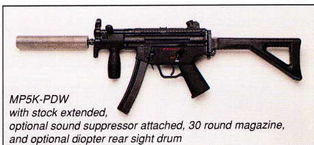
MP5K-PDW with stock extended, optional sound suppressor attached, 30 round magazine, and optional diopter rear sight drum

Immediately after its introduction as a personal defense weapon for aircraft pilots and crewmen, the MP5K-PDW found favor with a variety of support personnel who require a simple, highly effective weapon that can be carried at all times, leaving the hands free to perform daily tasks.