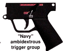
"Navy" ambidextrous trigger group