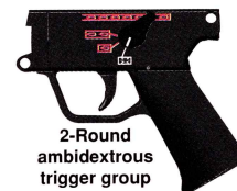
2-Round ambidextrous trigger group

(Left) MP5K-PDW worn in the HK nylon carrying rig. Pushing the PDW away from the body deploys the folding stock (above).