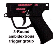
3-Round ambidextrous trigger group