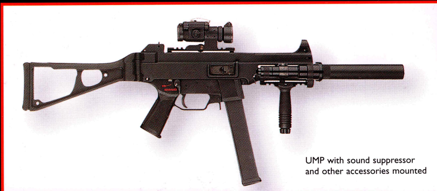
UMP with sound suppressor and other accessories mounted