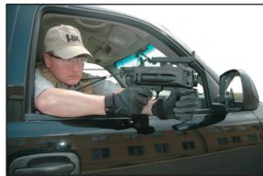
HK grenade launchers can be fired without a stock using a special bungee sling.