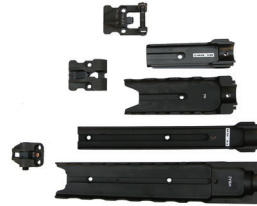
HK Grenade Launcher adaptor kits