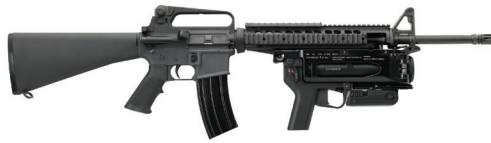
M16A4 Rifle with HK Grenade Launcher (GL Model "AG-M16A4") M320 includes M16 adapter kit,