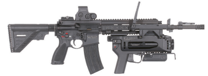
HK416 A5 carbine with HK Grenade Launcher (HK GLM fits HK416 A5 and "first gen" HK416)