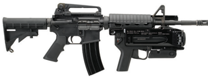
M4 Carbine with HK Grenade Launcher (GL Model "AG-M4") M320A1 includes M4 adapter kit