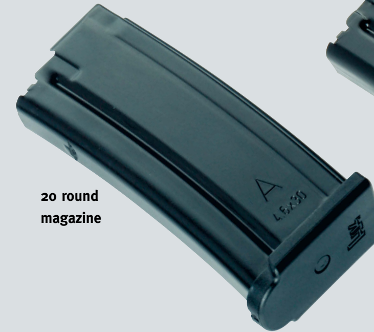
20 round magazine