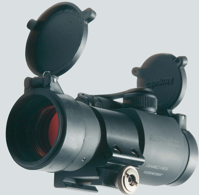
AIMPOINT Red dot sights