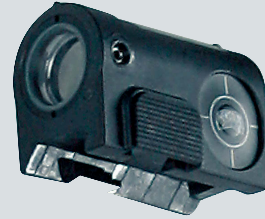
Hensoldt RSA Red dot sight