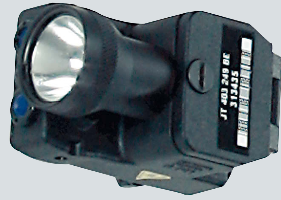
Oerlikon Contraves LLMo1