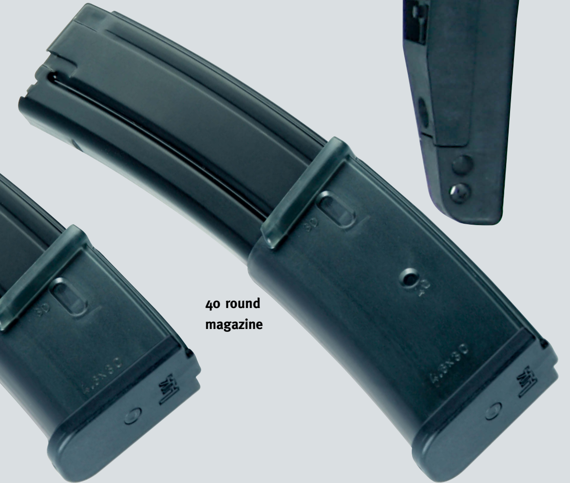
40 round magazine