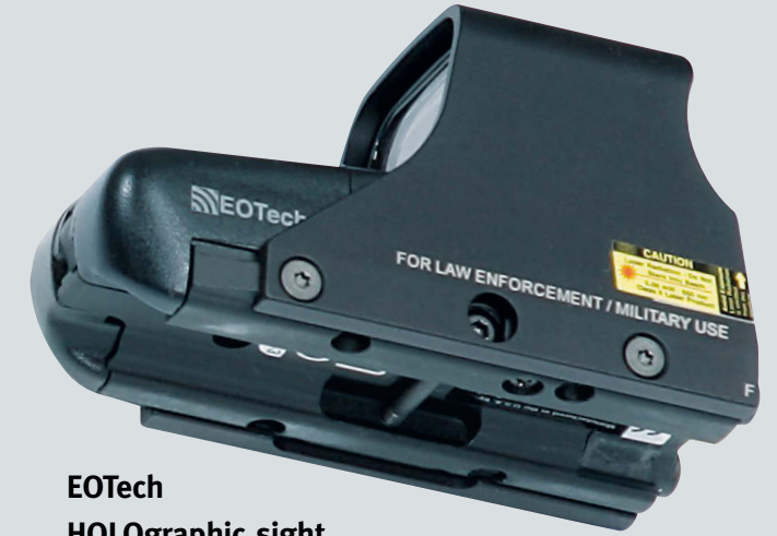
EOTech HOLOgraphic sight