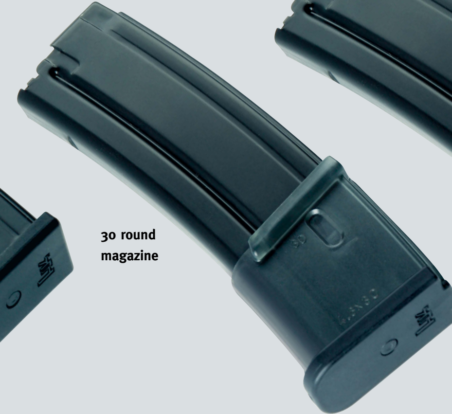
30 round magazine